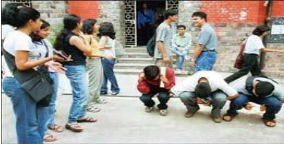
Photograph of Ragging: 4