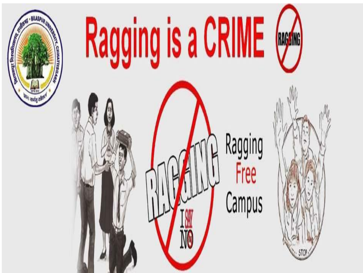
Photograph of Ragging: 1