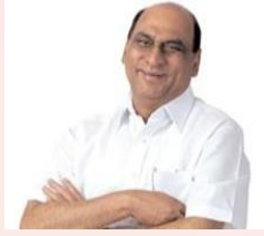
Hon'ble Shree Dattaji Meghe Hon'ble Chancellor DMIHER (DU), Sawangi (Meghe), Wardha