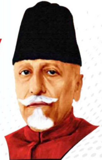
Maulana Abul Kalam Azad