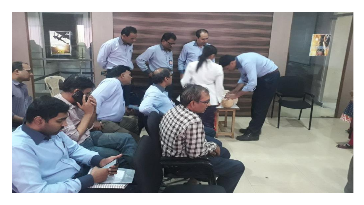
CPR Awareness at Nayara Petroleum Company, Nimgaon