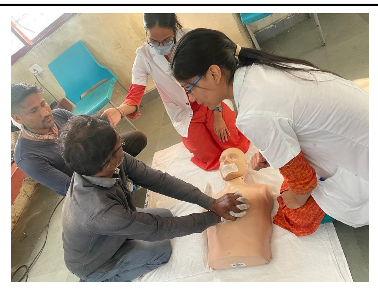
CPR Community Awareness at Bus Stop at Wardha