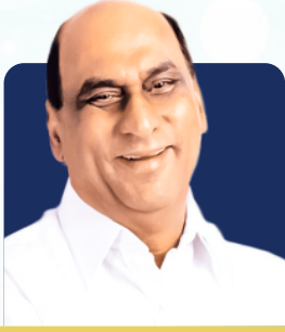
Shri. Dattaji Meghe Hon'ble Chancellor, DMIHER (DU)